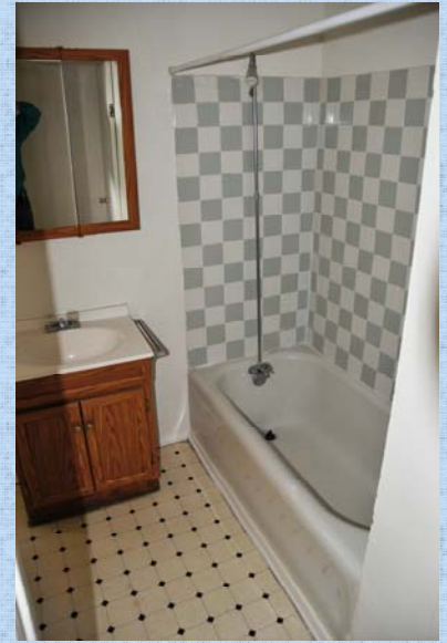
Tiled bathroom and kitchen

This 2nd floor single with bathroom and kitchen is now available for $1,300 per month.