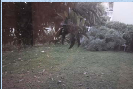
Overlook the building's yard.